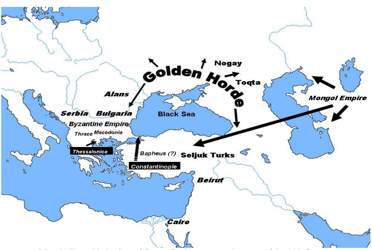
Map dealing with the time of George Pachymeres, on the verge of the 14th Century

From the 11th century, Thrace and Macedonia appear to have been usually combined, as attested by numerous strategoi and judges holding jurisdiction over both themes. The name fell out of use as an administrative term in the Palaiologan period but it is still encountered in some historians of the time as an antiquarian term.